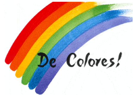
We contacted churches and 3-day Day movements

“Commit your way to the LORD; trust in him and he will act.” Psalm 37:5