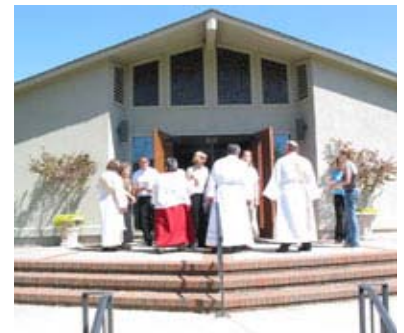
Church of Our Savior Martinez, Georgia